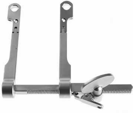
Rack Retractor single hinge RS 3010 - max. spread ~ 77mm RS 30102 -max. spread ~ 123mm