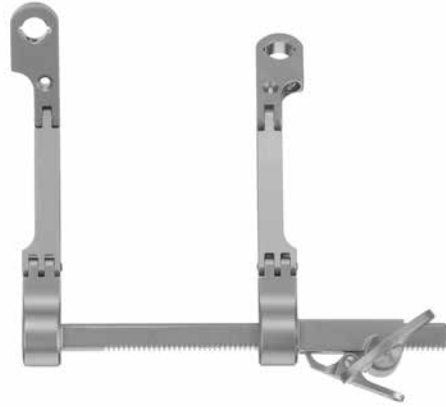
Rack Retractor double hinge RS 4620 - max. spread ~ 77mm