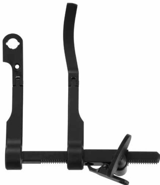
Counter Retractor Frame Stainless Steel, blackened RS 4610 - max. spread ~ 45mm RS 4610-160 - max. spread ~ 90mm