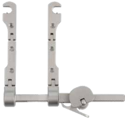
Rack Retractor Stainless Steel Frame RS 4800-SL - max. spread ~ 76mm