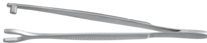
Blade Changing Forceps RS 4711 - 115mm Blade ejector, for changing the blades