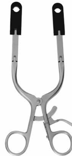
Peek Ring Handle Retractor stainless steel with Peek arms double hinge RS 4013 - max. spread ~ 96mm