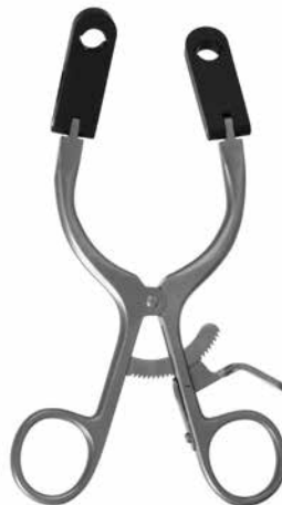
Peek Ring Handle Retractor stainless steel with Peek arms single hinge RS 4012 - max. spread ~ 87mm