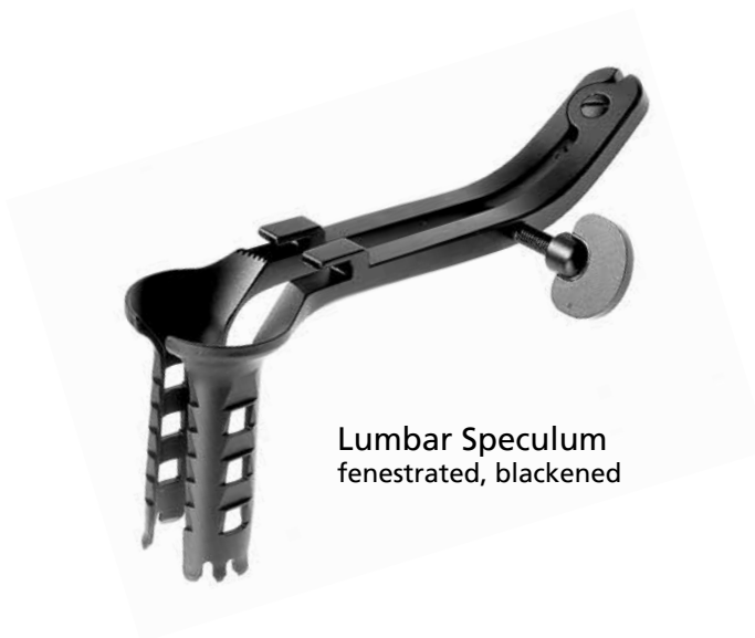
Lumbar Speculum fenestrated, blackened