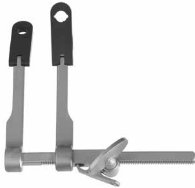
Peek Retractor stainless steel with Peek arms single hinge RS 3012 - max. spread ~ 70mm RS 3013 - max. spread ~ 142m