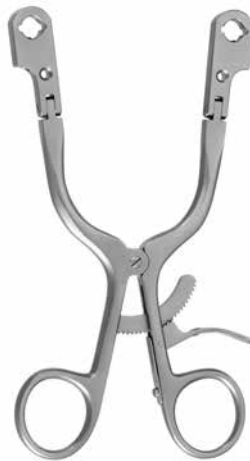
Ring Handle Retractor single hinge RS 4010 - max. spread ~ 89mm