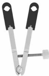
V-Handle Retractor stainless steel with Peek arms single hinge RS 4612-P - max. spread ~ 71mm