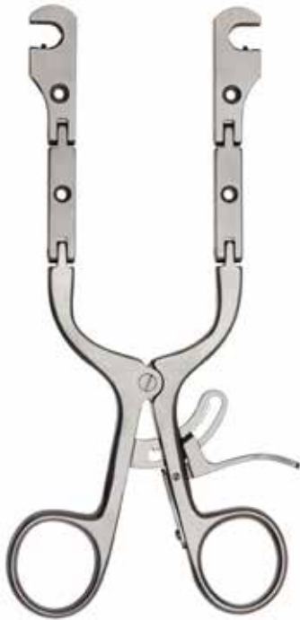
Ring Handle Retractor Stainless Steel Frame RS 4802-SL - max. spread ~ 87mm