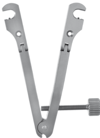
V-Handle Retractor (simple style) Stainless Steel Frame RS 4808-SL - max. spread ~ 79mm