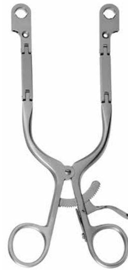
Ring Handle Retractor double hinge RS 4011 - max. spread ~ 96mm