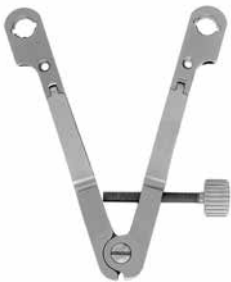
V-Handle Retractor single hinge RS 4612 - max. spread ~ 76mm