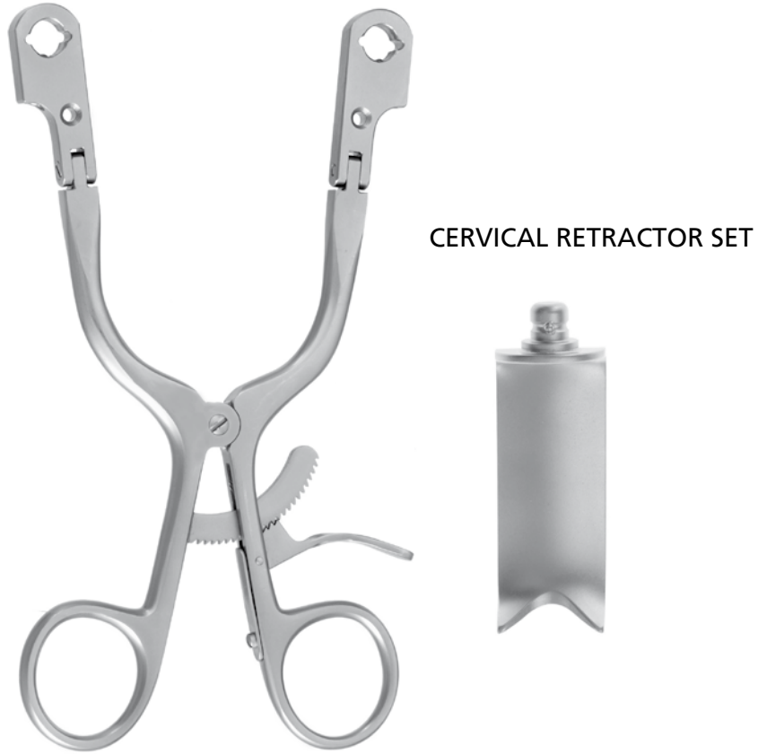
RS 4010SET - Ring Handle Retractor + 5 Blunt Blades