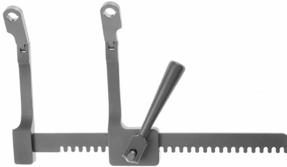
Laminectomy Rack Retractor stainless steel single hinge RS 7455 - max. spread ~ 170mm