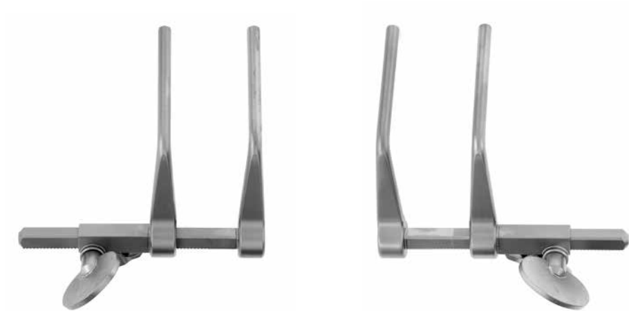
Vertebral Distractor left RS 4621 - max. spread ~ 60mm RS 4623 - max. spread ~ 80mm