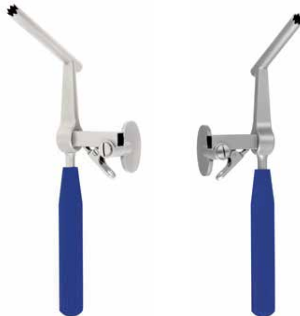
Drill Guide left RS 4627K

Vertebral body distractor for use in surgical procedures from the right and from the left approach. Elongated version is used for multilevel (more than 2) distraction.