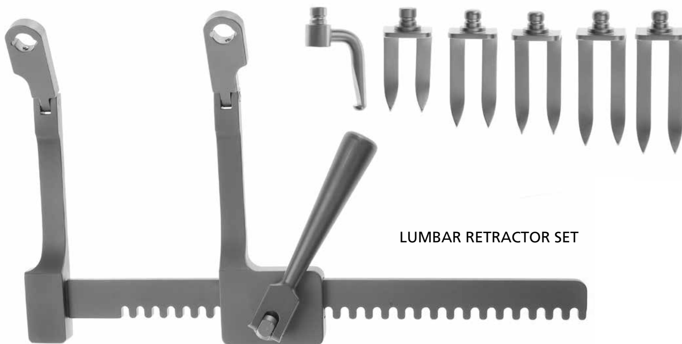
RS 7455 Set - Rack Retractor + 6 Hook Blades