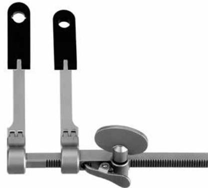
Peek Retractor stainless steel frame with Peek arms double hinge RS 4622 - max. spread ~ 70mm RS 46220 - max. spread ~ 142mm