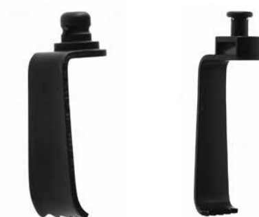
Lateral Blade for Counter Retractor Paraspinal Blade for Counter Retractor